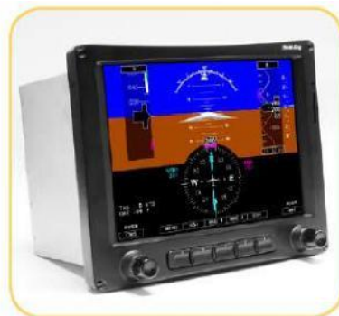
UAV Flight Control Uncertified Avionics

The ACEINNA VG380SA integrates highly-reliable MEMS 6DOF inertial sensors with extended Kalman filtering in a miniature factory-calibrated module to provide consistent performance through the extreme operating environments in a wide variety of dynamic control and navigation applications.