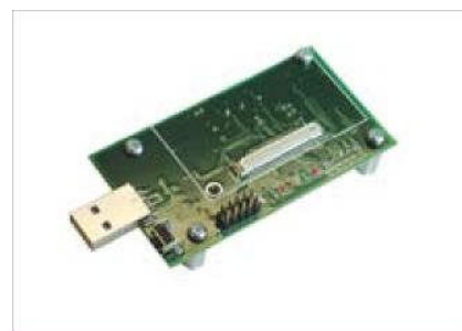
MIB520CB Mote Interface Board

Specifications subject to change without notice