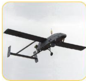
UAV Flight Control

The AHRS440 combines highly reliable MEMS sensors (gyros and accelerometers) with low noise magnetometers to provide accurate attitude and heading in a small and rugged environmentally-sealed enclosure. The AHRS440 provides consistent performance in challenging operating environments and is user-configurable for a wide variety of applications.