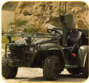
Navigation and Control