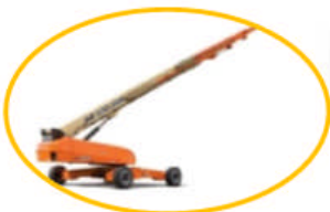
Aerial Lift Safety