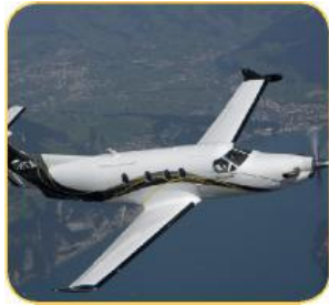
Primary Flight Display Heading Reference

The CRM-Series remote magnetometers are high performance three-axis strapdown magnetic field measurement systems. They are designed as a local magnetic field reference for use with high performance Attitude & Heading Reference Systems. The CRM-Series remote magnetometers are easy to install, and they incorporate MEMS accelerometers to support automated co-alignment with the AHRS500CA, AHRS510CA or third party AHRS.